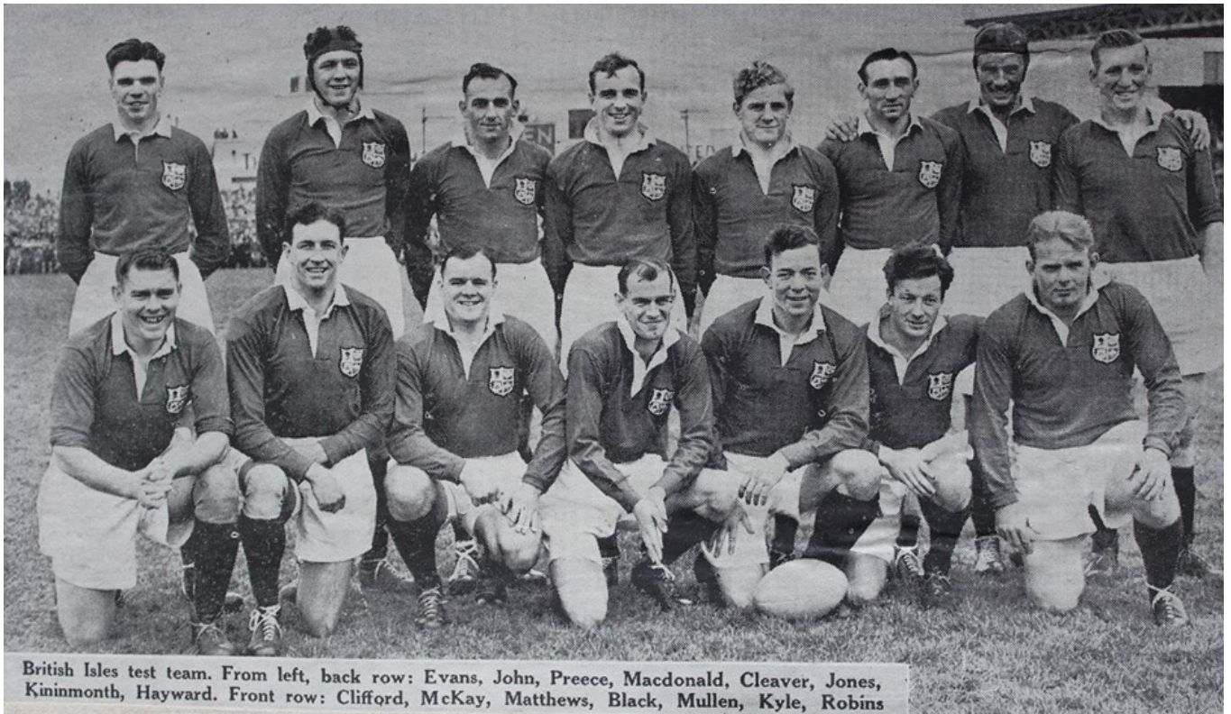
First test team.

WHOEVER organised the British Lions tour to New Zealand in 1950 had clearly done his homework.